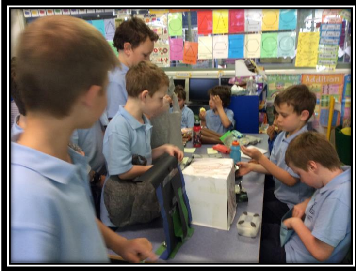
Week 1: Grade 1 and 2 Shops

Term 4 is an incredibly busy term and there is lots happening in the Grade 1 and 2 area. We will be having a whole school Science Day and this year the Walk-a-Thon will be a Superhero theme. Students are asked to dress up as their favorite superhero or create their own. The highly anticipated Grade 2 sleepover is coming up shortly and of course we will have Fun Food and Carols and the End of Year Awards Ceremony later in the term. Term 4 also marks the 20 th year of Parkhill Primary School and we will be having a special assembly to mark this occasion on Friday 6 th November at 2:30 p.m.